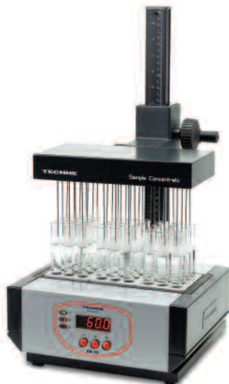
Standard Sample Concentrator (FSC400D).